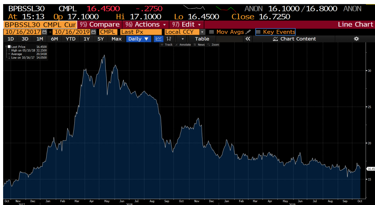
Figure 2: 30-year 3-month GBP LIBOR vs. SONIA Spread

converge to the historical spread value as the anticipated date of LIBOR discontinuation nears. Market repricing of the spread has resulted in periods of volatility especially in Q2 2018 which saw a marked spread widening most likely associated with the early exit of Libor positions from buy side firms. However, the effect of a more orderly market repricing can be observed in the SONIA/LIBOR spread following the release of the ISDA consultation in November 2018, 7 as illustrated in Figure 2 below.